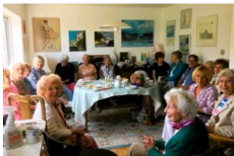
Pause for thought