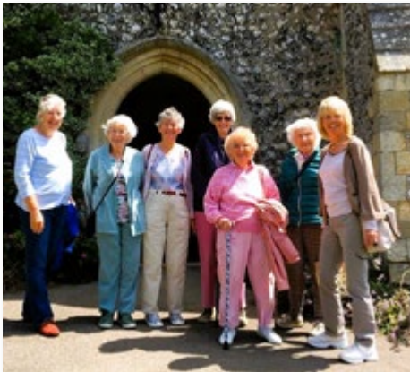
Friends at Rottingdean