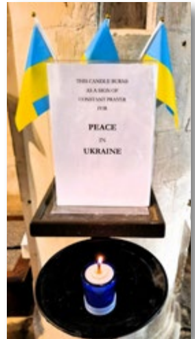
Candle for Ukraine

As we prepare for Christ's birth and the New Year ahead may you be blessed with a candle to light your way.