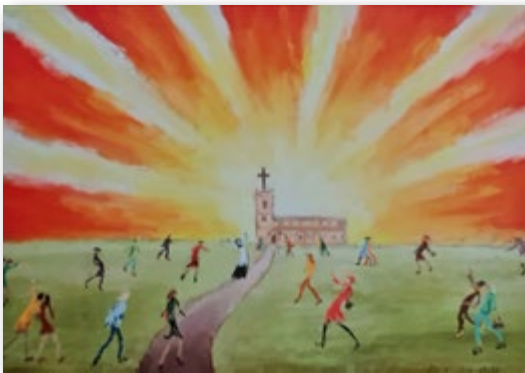
Wives at Church

To purchase please email your order to Caroline at literature@womeninfellowship.org.uk . There are plenty of each design but do purchase now to avoid disappointment.