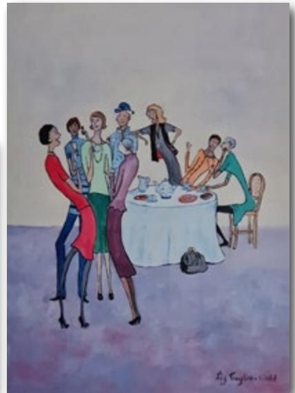
Wives at Tea