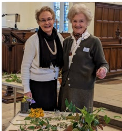
Gardener's Question Time

our own members gave us a fascinating insight into Japanese stitching, which was followed in the New Year with a practical workshop. 2022 concluded with an Advent talk that saw us 'Bethlehem Bound' with some of those present at the Nativity. In December we celebrated our annual 'Christmas Words and Music.'