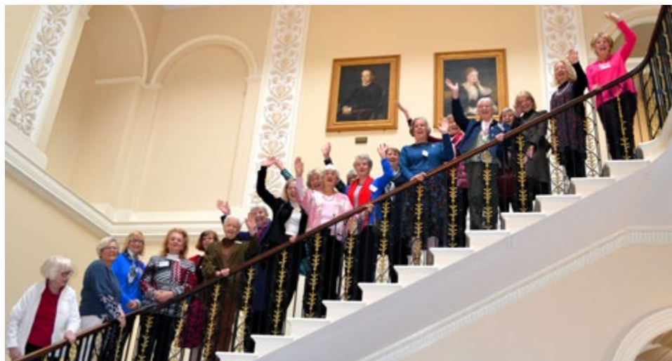
Culford School Staircase