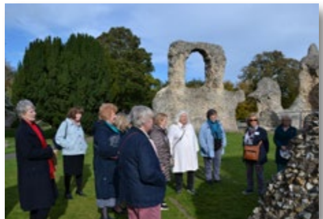
Tour of the Priory Gardens

As we departed Culford School it was apparent once again that Women in Fellowship is an organisation that recognises the best in women and the Christian ethos that defines us. I felt privileged to be a part of the group and humbled by the achievements of three remarkable women. I should add that the organisers of the event showed themselves to be remarkable as well, it was an outstanding two days.