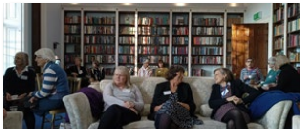
Culford School Library