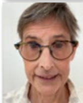
Communications Officer (2022)